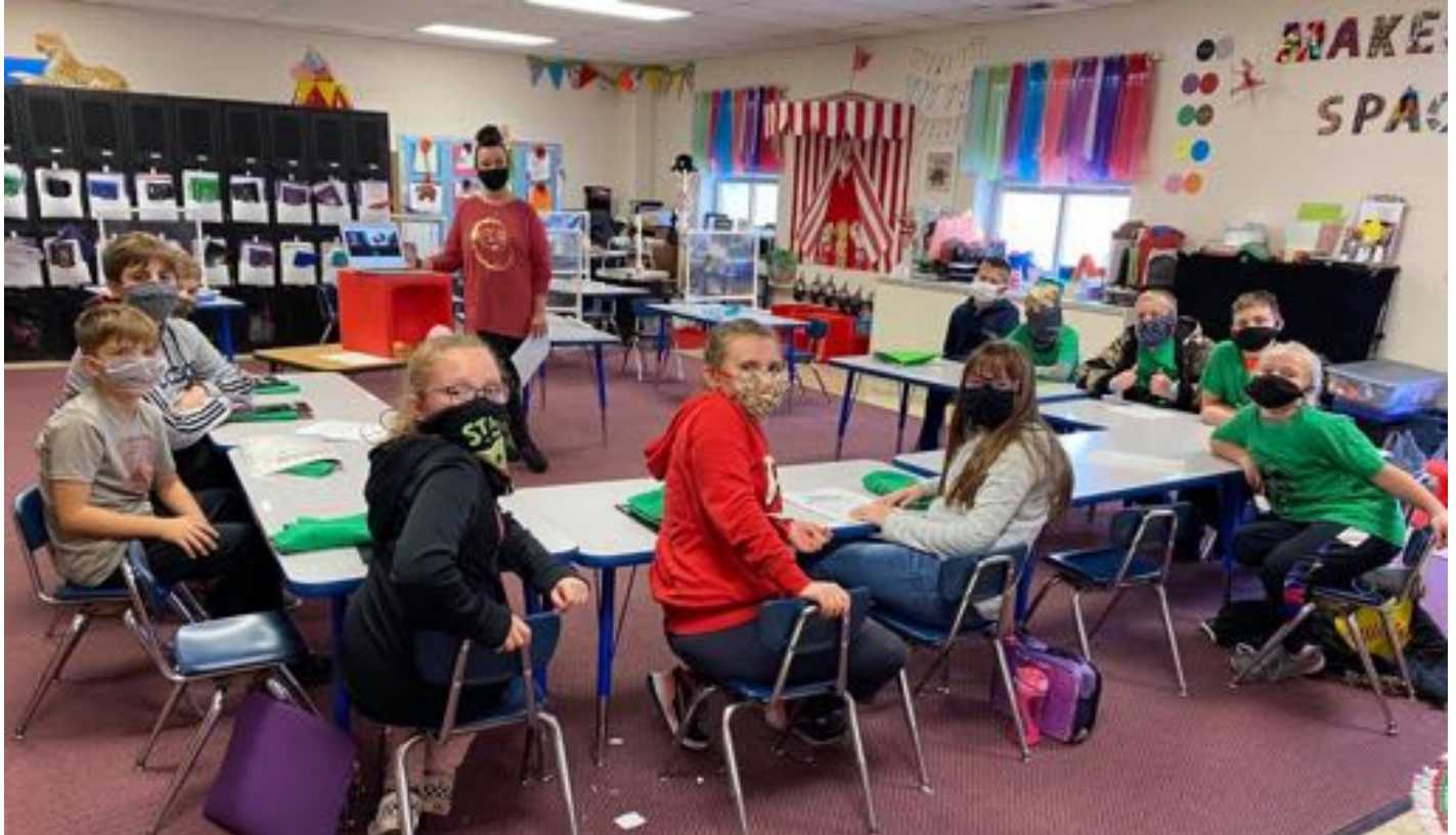
Pictured above: NEEE Students Council Meeting.