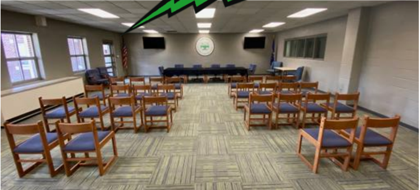
Pictured above: Newly renovated NESC board room held its first meeting here in December. A few finishing touches on the space will be wrapping up shortly.